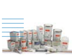
Valspar Industrial Line